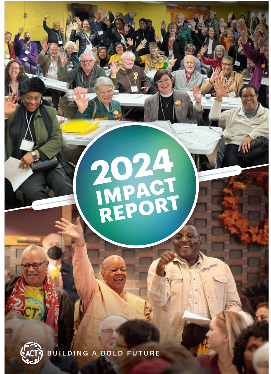
PHOTO CREDITS: David Choy — The second page on the cover; All photos on pages 2 and 3; The second photo on page 5; All photos on page 7; The second photo on page 8; All photos on pages 10 and 11 / Grafton Johnson — The first photo on page 4

Contact Katie Zinler ( katie@actaaco.org ) to learn more about joining ACT.